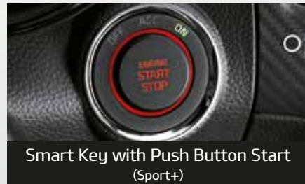
Smart Key with Push Button Start (Sport+)