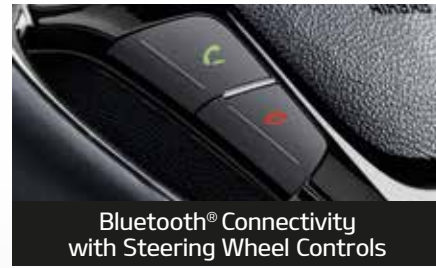
Bluetooth® Connectivity with Steering Wheel Controls