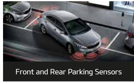
Front and Rear Parking Sensors