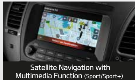
Satellite Navigation with Multimedia Function (Sport/Sport+)

Rear View Camera (Sport/Sport+ & Optional on S Auto)