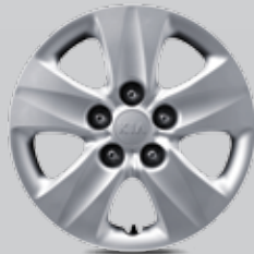
16" Steel Wheel (S)