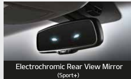
Electrochromic Rear View Mirror (Sport+)