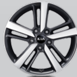
17" Alloy Wheel (Sport & Sport+)

Bluetooth® is a registered trademark of Bluetooth SIG. #Apple CarPlay™ connectivity requires compatible iOS device. See apple.com.au for more details. Android Auto connectivity requires compatible Android device. See android.com/intl/en_au/ for more details. Apple CarPlay™ and iPhone® are registered trademarks of Apple Inc. Android Auto is a registered trademark of Google Inc. †Leather appointed seats may comprise of genuine leather, polyurethane and other man-made materials or a combination thereof. Kia's unlimited km 7 year warranty: 7 year/150,000km warranty for vehicles used for the following: rental vehicles, hire cars, taxis, courier vehicles, driving school vehicles, security vehicles, bus and tour vehicles. Capped Price Servicing: Maximum payable for specified number of manufacturer's standard scheduled maintenance services up to 7 years or 105,000kms, whichever occurs first. Complimentary Roadside Assistance for the first year. Renewed yearly by completing scheduled maintenance services at Kia Dealerships (up to maximum 7 years). Terms and conditions for Warranty, Capped Price Servicing and Roadside Assistance can be found at www.kia.com.au